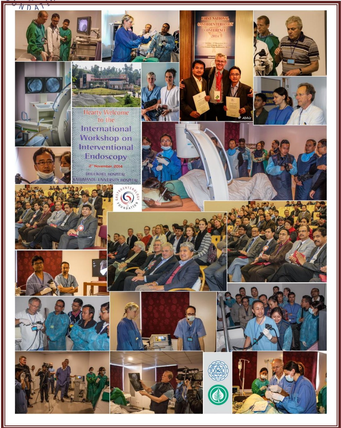
2 nd Workshop for interventional endoscopy at the Endoscopy Training Center of the 'Dhos'