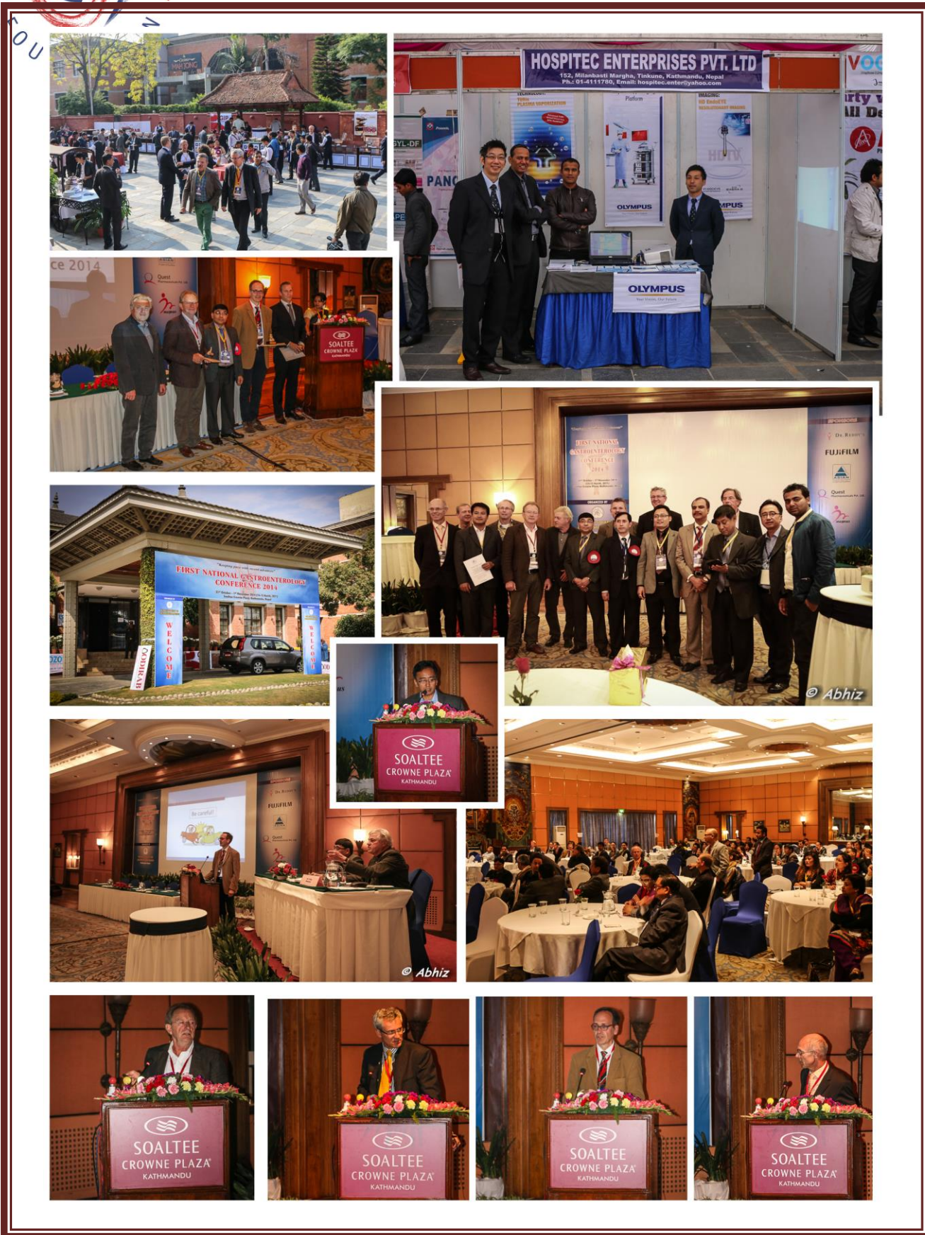
1 st Conference of the Nepal Society of Gastroenterologists, 2014 in Kathmandu