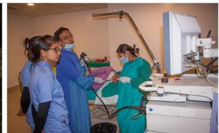
OPD at Dhulikhel Hospital. Opening of the Endo unit on the 3 rd floor on November 2, 2014